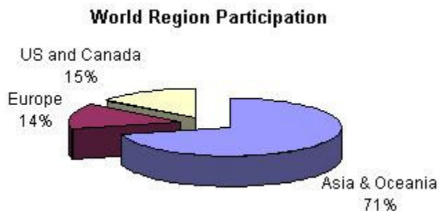
Table 3 – AOGS 2005 Regional Representation